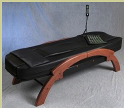
Jade Stone Massage Bed