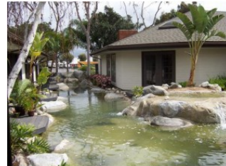
Peaceful Water Garden Setting at Know Your Options

Find out how eating, lifestyle and ways of thinking effect your colon, and how the condition of the colon impacts your health.