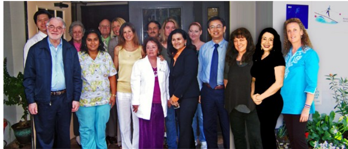
The dedicated staff at Know Your Options